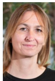
Donna FSW/ TYPP Creche