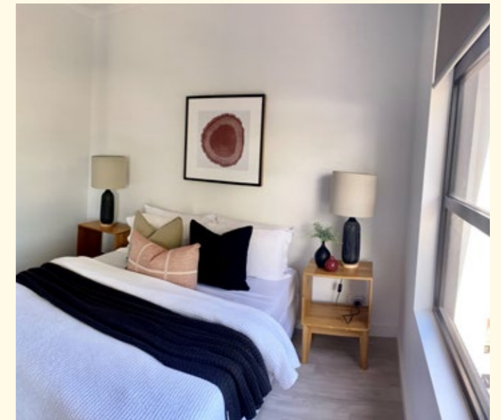
The Melrose Park Apartments