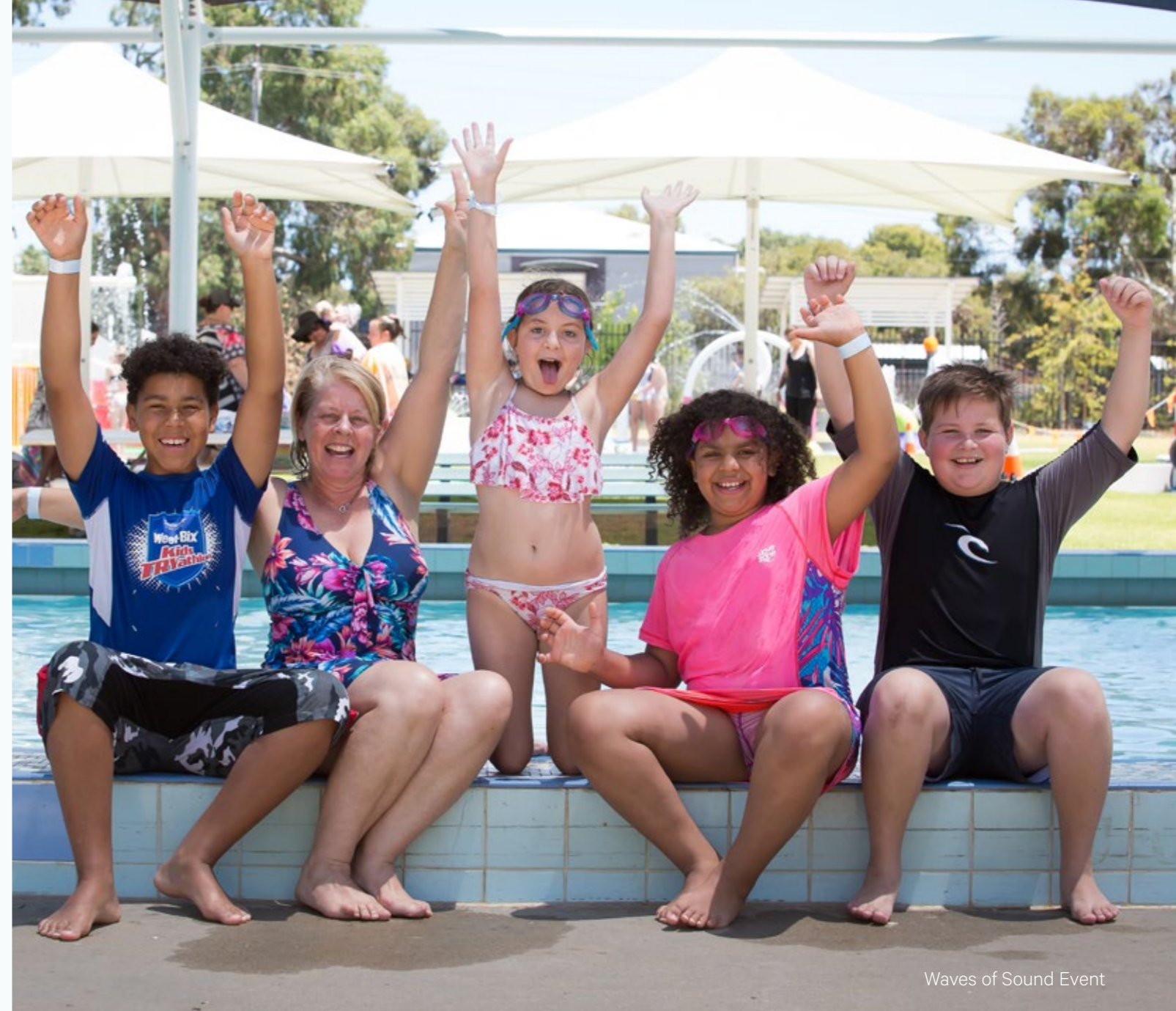
Waves of Sound Event

Junction acknowledges we are living on traditional Aboriginal Lands and we offer our continued respect to Aboriginal people past and present.